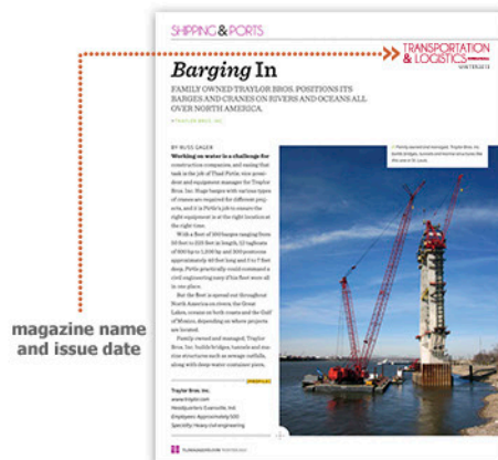
FRONT (page 1)

Make the most out of your advertising dollars through our custom brochure and digital flip book service.