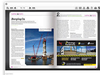
DIGITAL FLIP BOOK

Digital flip books can be placed on your website or emailed to new clients for unlimited use and take your message to the next level.