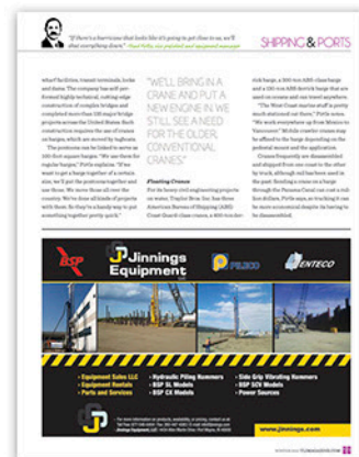
BACK (page 2)

Brochures are printed on high-quality paper and can be turned around in ten business days from the day you approve your brochure layout!